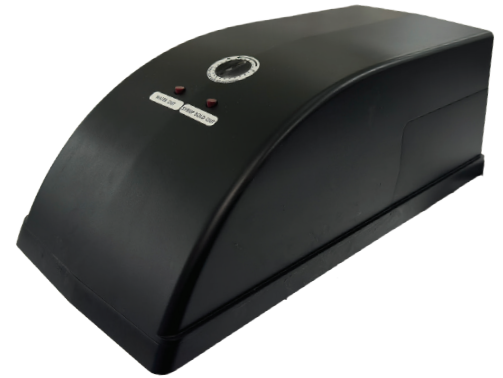
Crathco Autofill Lid Puts a Lid on Labor